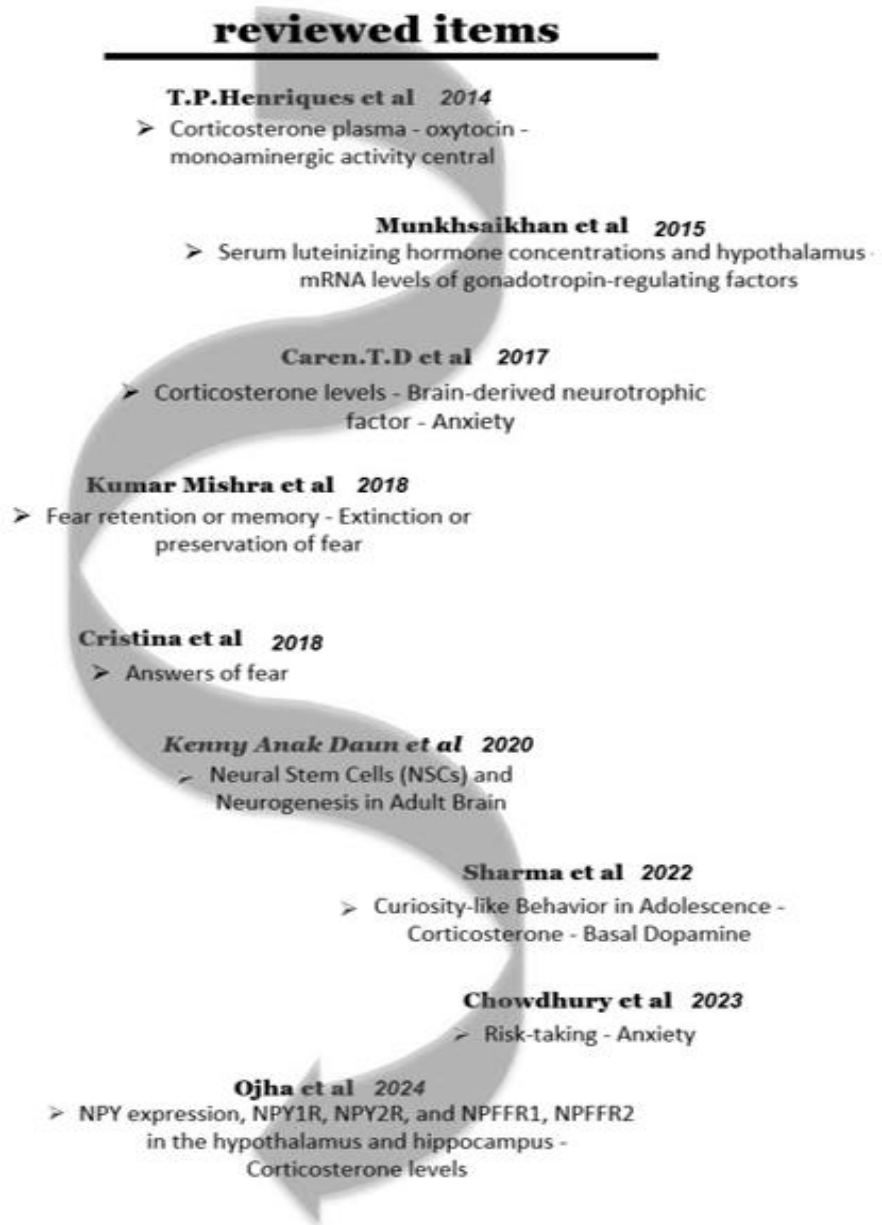
Figure 2. The items reviewed in the most important articles listed in the last ten years. Evidence suggests that individuals' behavior and temperament traits can be influenced by various interventions received during the time window of SHRP.